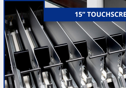
HANDLE ANY SIZE PACKAGE