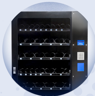
IIC Sightguard Vending Machine