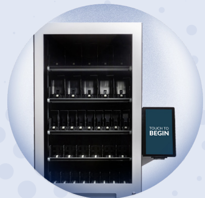
Vision ES Plus Vending Machine