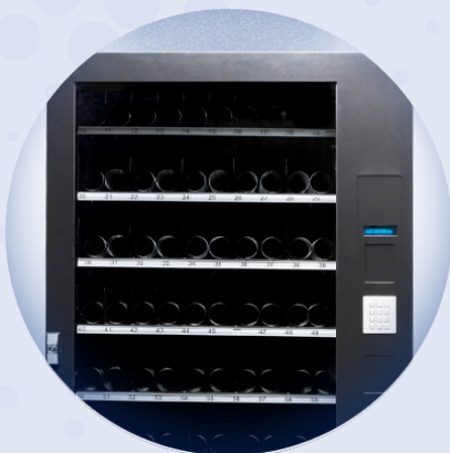
Optima Helix Vending Machine