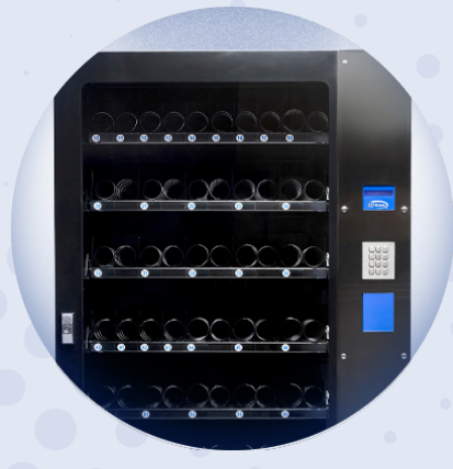
IIC Sightguard Vending Machine