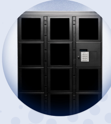
Versa SmartLocker 18S