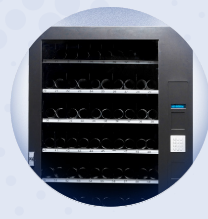
Optima Helix Vending Machine